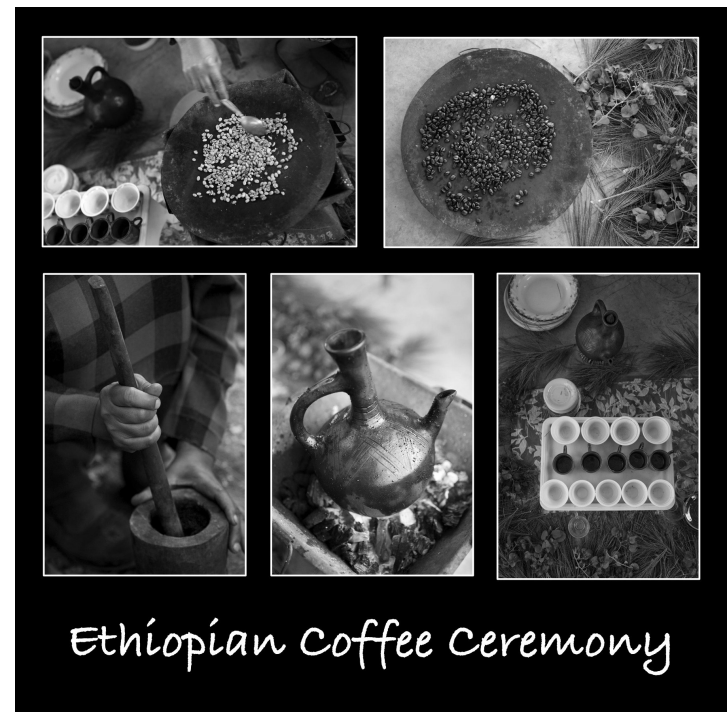
Ethiopian Coffee Ceremony